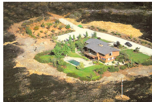
Lake Tahoe, 2013