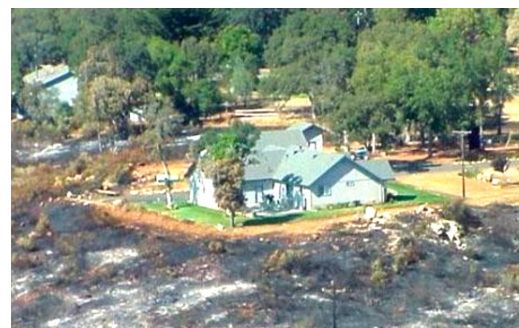
Marin County, 2017