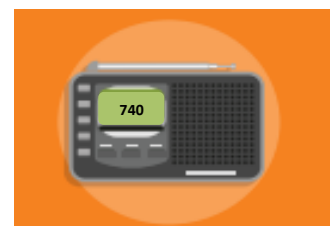
Tune into KCBS 740 AM

Turn on your radio or TV for important safety advisories and information for emergency housing, food, first aid, clothing and financial assistance. Resources may be available from federal, state and local governments.