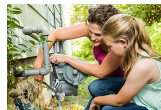
Practice how to shut off utilities

Post OK / HELP sign on your front door. If you are able, check on your neighbors, especially those who are seniors or disabled.